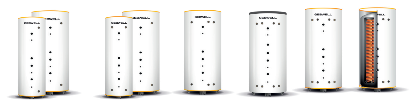
G-Energy Coil 501 ja 1000 1x25 G-Energy Coil 1000 3x25