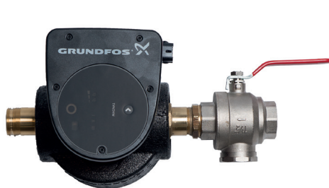
Pump heating group 6m3/h