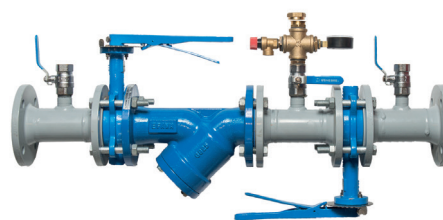
Collector valve group DN65-80