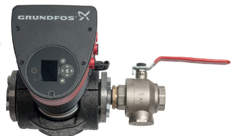
Pump heating group 12m3/h