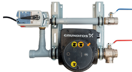
Heating control group LSR Si KV6.3-16