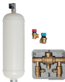
Collector valve group DN25

Valve group is meant as accessory for all Gebwell heat pumps.