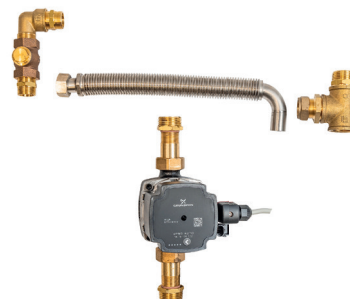
Heating pump extension for installation set