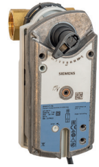
Change-over valve set

The change-over valve set includes the change-over valve and an actuator. Accessory for the Gebwell T3 Inverter, G-Eco Core, Gemini Inverter, Taurus EVIC, Taurus Inverter Pro and G-Eco Pro heat pumps.