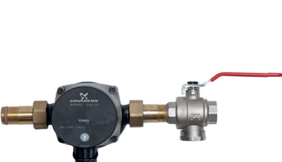
Pump heating group 2m3/h

Its recommended to install the block thermostat in underfloor heating. The block thermostat are delivered by Gebwell Ltd.