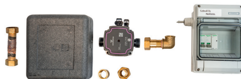
Cooling accessories for installation set